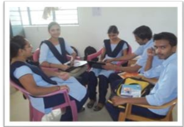
Students of BVVS College discussing their Business Plan.