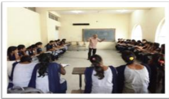
Students engrossed in the costing session

I Create Rajasthan conducted a CMS program at S.S.Jain Subodh PG Mahila Mahavidyalaya, Rambagh, Jaipur from 22 nd of September to 25 th of September for 60 students. The session was conducted by Ranju Mehta, Anju Bothra and Ms.Hema Chawla