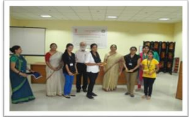
Winners of the Business Plan Competition at Subodh College.