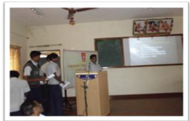
Students presenting their Business Plan at Nanjegud.