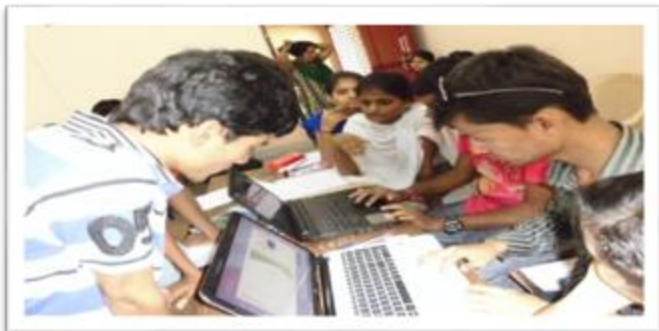
JSS Students planning their Business Plan Presentation

A TOT was conducted at IIT-Gandhinagar for 28 Participants which included the faculty of IIT-Gandhinagar and Saffrony Institute. The future master trainers were trained by Ulhas Kamat, Venkatesh and Tejaswini Venkatesh