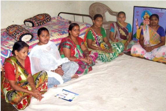
EAP Participants at Vadi Vadi, Vadodara