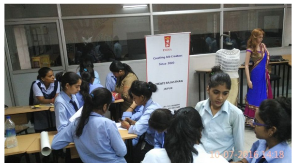
Students of Govt. ITI (women), Jaipur discussing their Business Plan

I Create Rajasthan conducted a workshop at the Govt. ITI (Women), Jaipur from 4 th to 7 th October for 32 Students. The workshop was