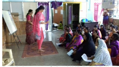
Participants of the UNDP EAP listening attentively.