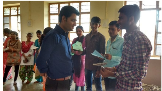
Students enjoying an activity during the AEW.