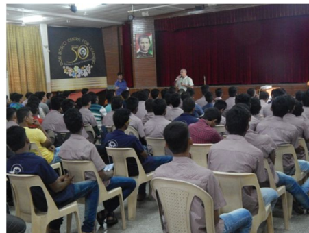
Participants of DBIT, Kurla during the EAP