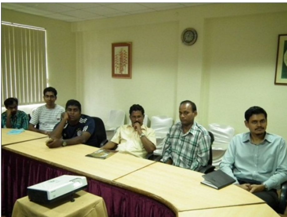
Participants during the Goa EAP