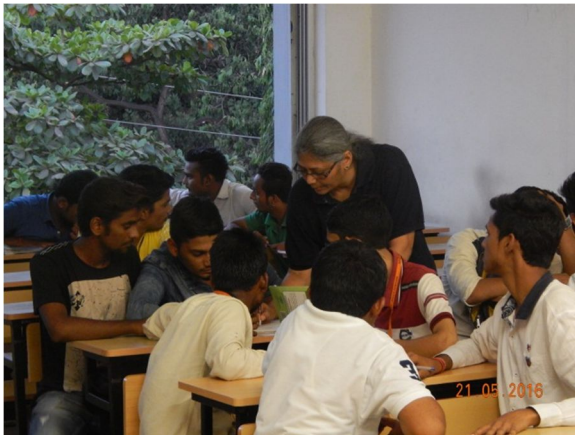
Students discussing with the Facilitator during the CMS workshop