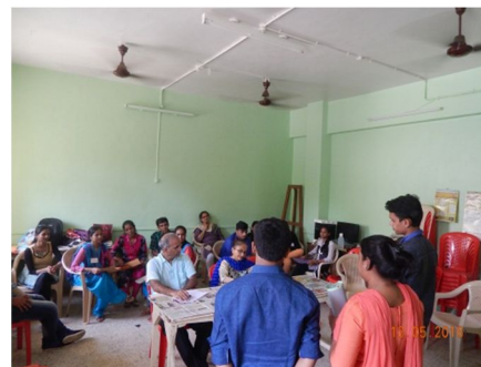
Participants of YMCA presenting their Business Plan.