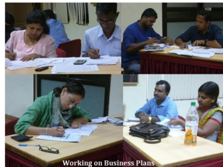
Participants of The International Center Goa working on their Business Plan