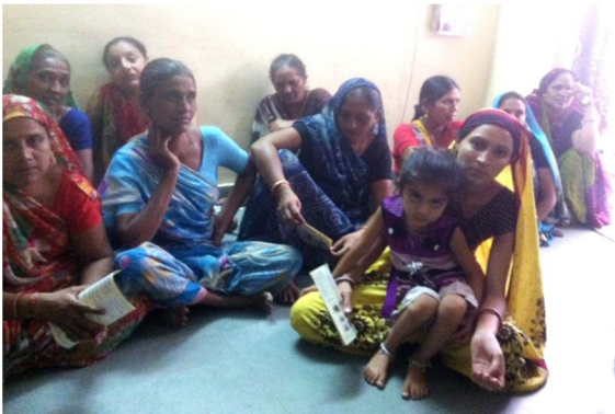
Participants at Manjusar Village, Vadodara during the workshop.