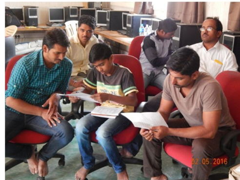
Participants of Navlakha Umbre village during a discussion