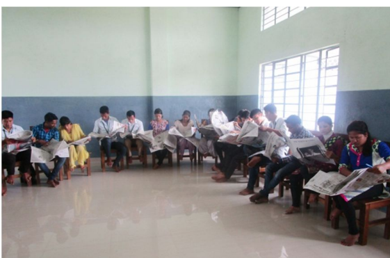
Participants during the Newspaper exercise at the workshop conducted at Don Bosco Tech, Rangajan, Golaghat, Assam from 25 th to 30 th April for 16 participants.