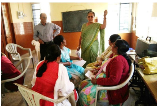
Participants at the workshop conducted at Navayard, Vadodara.