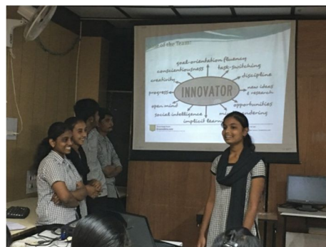
Students presenting their Business Plan at the CMS program conducted at SJP