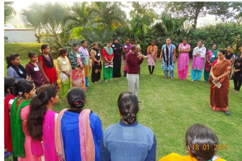
Participants enjoying an activity at the AEW conduct at Setco Foundation, Gujarat.