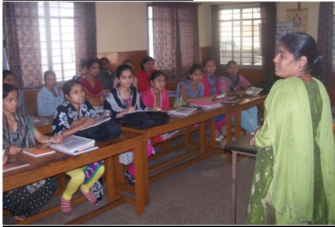
Students listening intently during the awareness program.