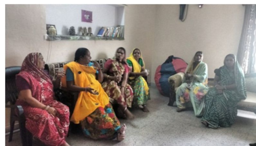
Participants discussing at the workshop conducted at Jawahar Nagar.