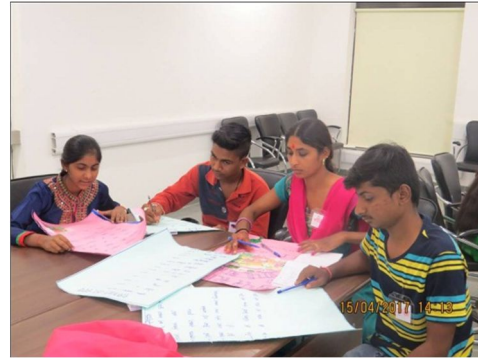
Participants preparing their Business Plan in the AEW conducted by NEEV