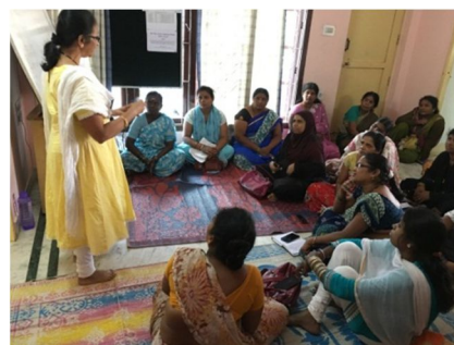
Participants listening attentively during the EAP conducted at Swasthi Mahila Sabha.