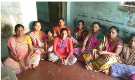
Participants at the Kishanwadi EAP, Vadodara.