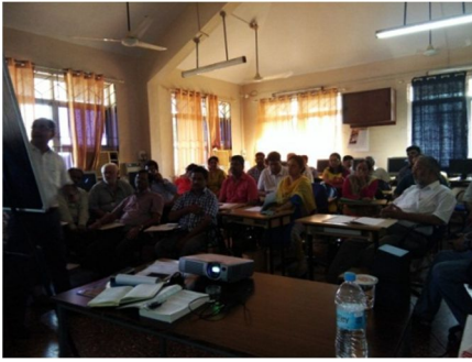
Participants during the EAP conducted at NITTTTR, Goa