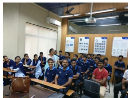
Participants at the EAP conducted at SKF, Pune.