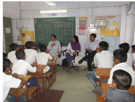
Participants at the Maa Bharti Institute, Vadodara during the EAP.