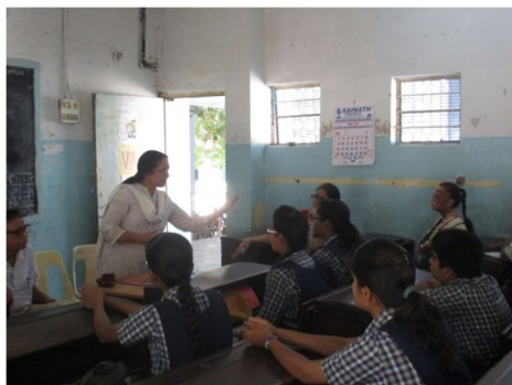
Students of Refinery School, Vadodara during the EAP