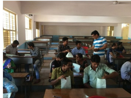
Participants playing the trade game during the AEW.