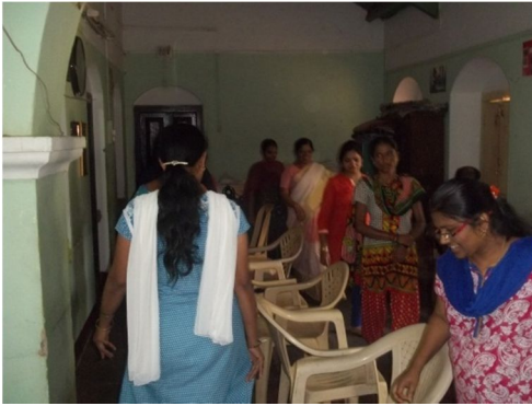
Participants enjoying an energizer at the workshop conducted at RAPID.