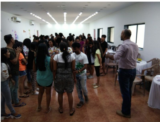
Participants during the EAP conducted at International Institute of Fashion Design, Goa