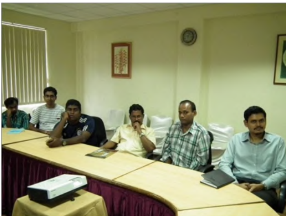
Participants during the Goa EAP