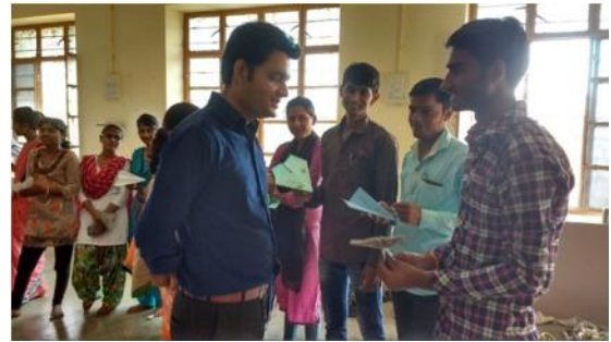
Students enjoying an activity during the AEW.