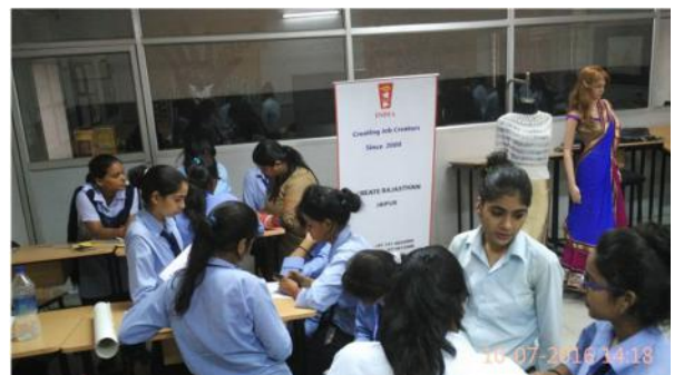
Students of Govt. ITI (women), Jaipur discussing their Business Plan

I Create Rajasthan conducted a workshop at the Govt. ITI (Women), Jaipur from 4 th to 7 th October for 32 Students. The workshop was