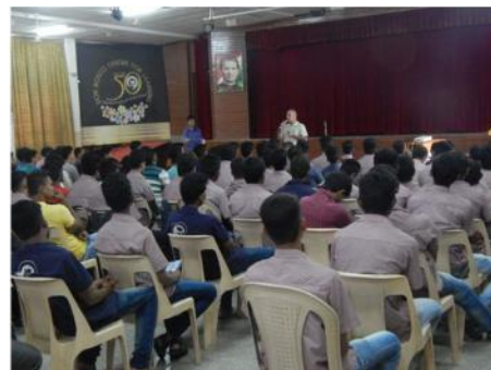
Participants of DBIT, Kurla during the EAP