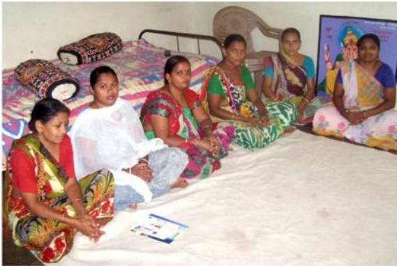
EAP Participants at Vadi Vadi, Vadodara