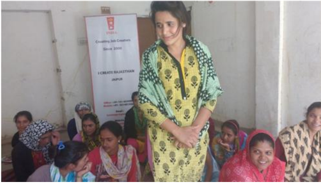
Participants during an interactive session conducted at Dayalpura Village, Rajasthan