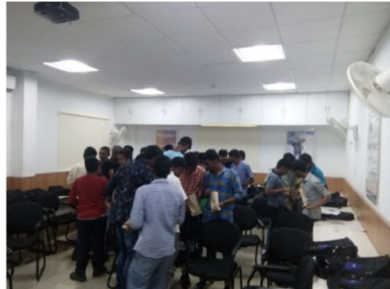
Participants playing the trade game during the AEW at SKF.