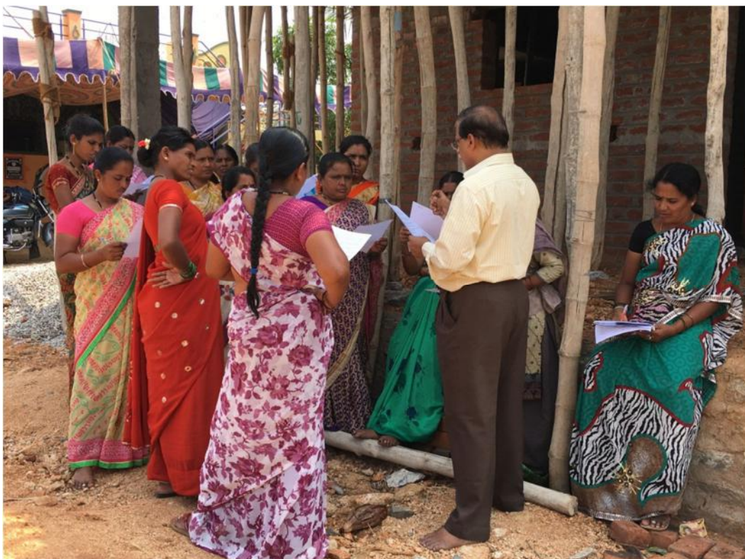
Participants practicing for the role play conducted at an AEW conducted at GRAMA, Chitradurga dt, Karnataka.