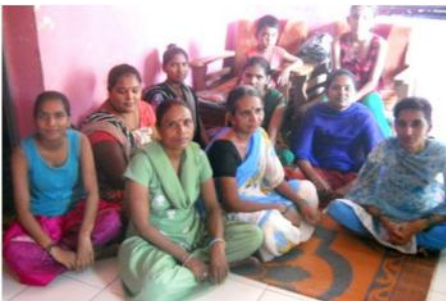
Participants at the EAP conducted at Tarsali, Vadodara.