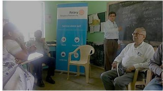
Participants during the EAP conducted at Kudurgere village.