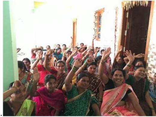
Participants raising their hands saying “yes” to entrepreneurship during the workshop conducted at GRAMS, Chitradurga.

Participants found the training useful. They figured out problems that can be converted in to small businesses.