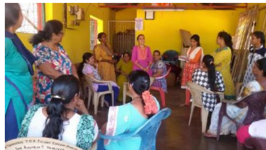
Members of Margadarshak introducing themselves