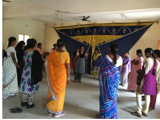
Participants of Mythri Seva Samithi during an Activity