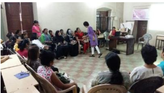
Participants of JCI Vasco interacting with the facilitator

VRDF conducted an EAP at Abhaya Ashram on 2 nd March for 35 participants. The session was conducted by Pankaja.