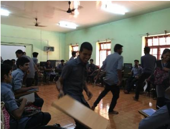
Students enjoying an activity during the workshop