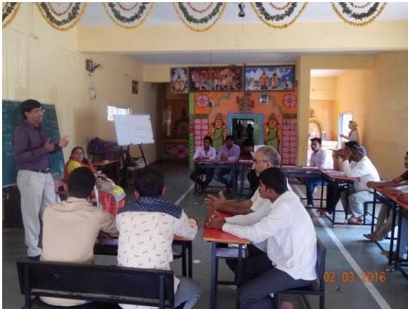
Participants of Badhlewadi Village during the AEW