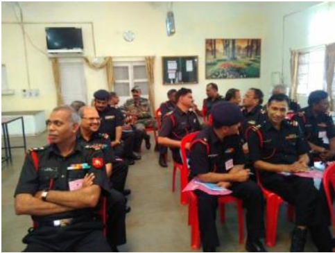
JCOs of Southern Command discussing during the EAP.