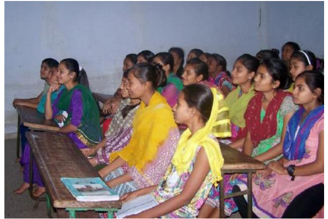
Students of Webb Memorial during the session