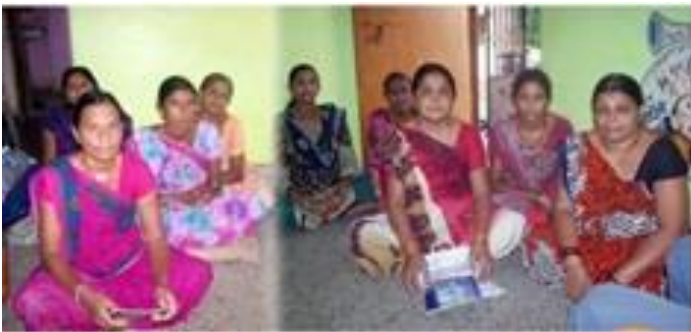
Women participants of Ranoli Village at the EAP