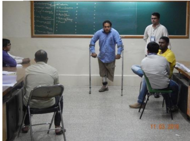
Participant of the AEW at Vigyan Ashram interacting with the group