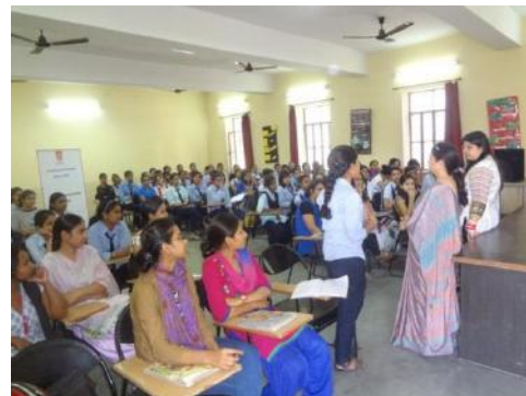
Students of ITI, Jaipur during an interaction.

I Create Snehdeep conducted an awareness program for 15 women at Poicha Village, Vadodara on 9 th March. The session was conducted by Joseph.