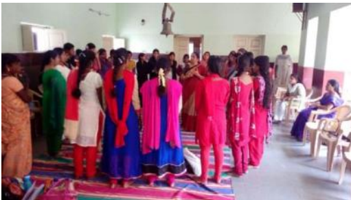
Abhaya Ashram Women during an activity