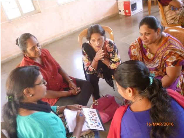
Participants of Margdarshak in discussion