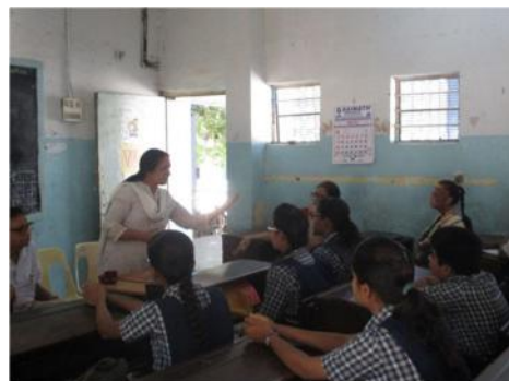
Students of Refinery School, Vadodara during the EAP