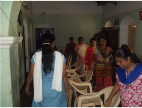
Participants enjoying an energizer at the workshop conducted at RAPID.