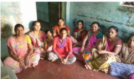
Participants at the Kishanwadi EAP, Vadodara.