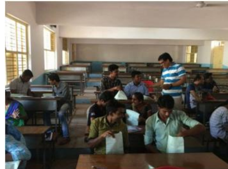
Participants playing the trade game during the AEW.