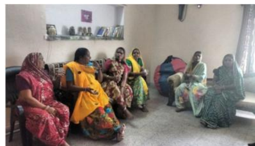
Participants discussing at the workshop conducted at Jawahar Nagar.