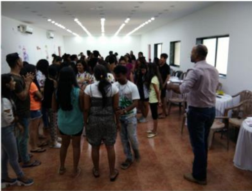
Participants during the EAP conducted at International Institute of Fashion Design, Goa