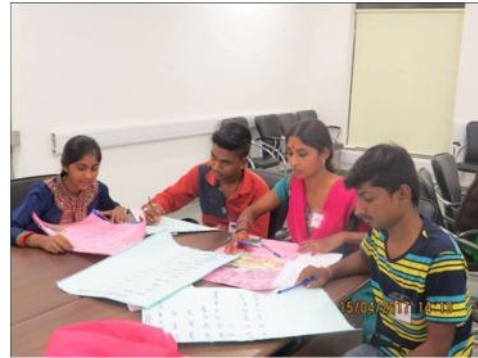
Participants preparing their Business Plan in the AEW conducted by NEEV