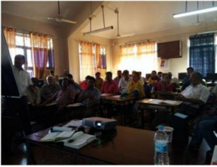
Participants during the EAP conducted at NITTTTR, Goa