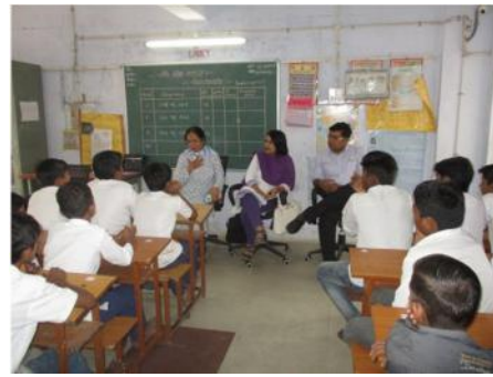
Participants at the Maa Bharti Institute, Vadodara during the EAP.