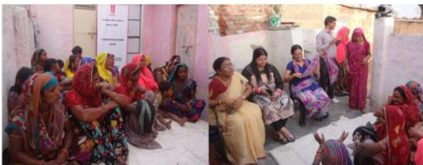
Participants of SOS village interacting with the Facilitators.