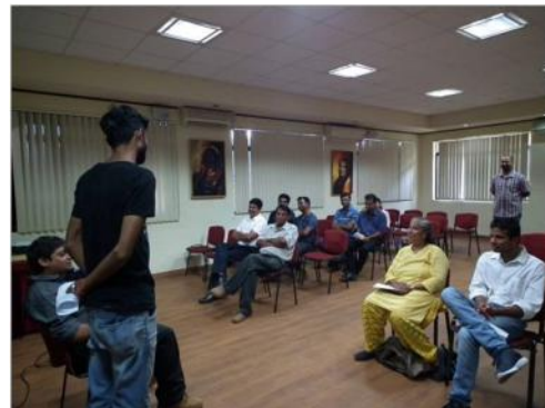
Participants during the awareness program at Goa.

I Create Banyan City conducted an awareness program for 53 participants at TARGON Village of Chhota Udaipur District near Vadodara. The session was conducted by Shashi Tuteja.