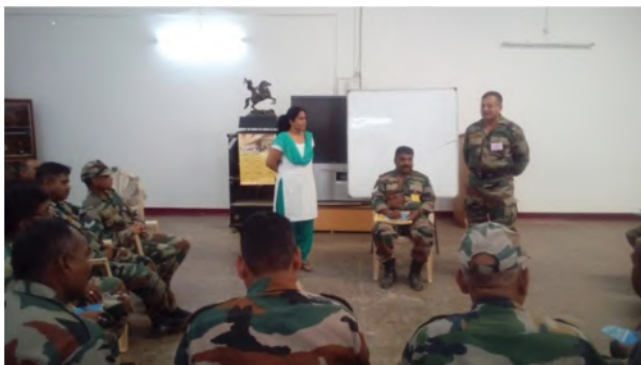
Army Jawans during the power of Networking session.