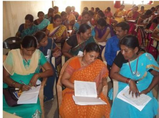
Women Participants of SKDRDP making notes during the awareness program.

NEEV (I Create center at IITGN) conducted two awareness sessions on 6 th and 7 th of April at Palaj Village. .