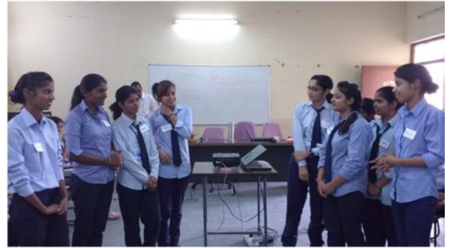
Students of Govt. ITI, Banipark, Jaipur during a debate.