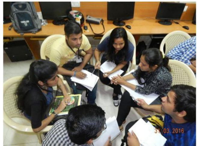
Students discussing during the CMS workshop