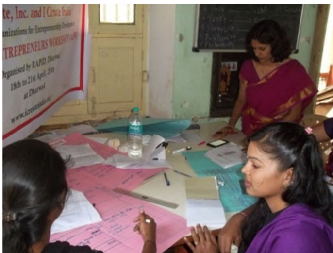
Participants of RAPID workshop gearing up to present their Business Plan.

NEEV (I Create center at IITGN) conducted a workshop from 11 th to 15 th April at Palaj Village. Details awaited