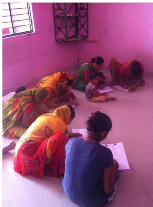
Participants of NEEV workshop during an activity.