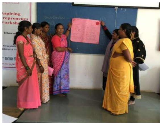
Participants of BDSSS presenting their Business Plan.