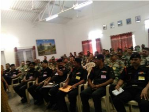
Army Jawans during the Awareness Program.